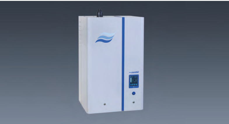
Condair EL – electrode steam humidifier

Condair's specialist range is combined with extensive expertise in the industry to ensure the most appropriate humidifier solution is always recommended for any healthcare project.