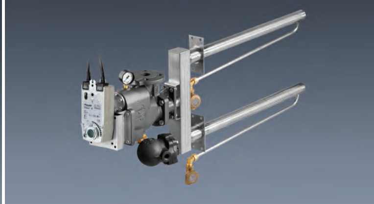
Condair ESCO – live steam humidifier