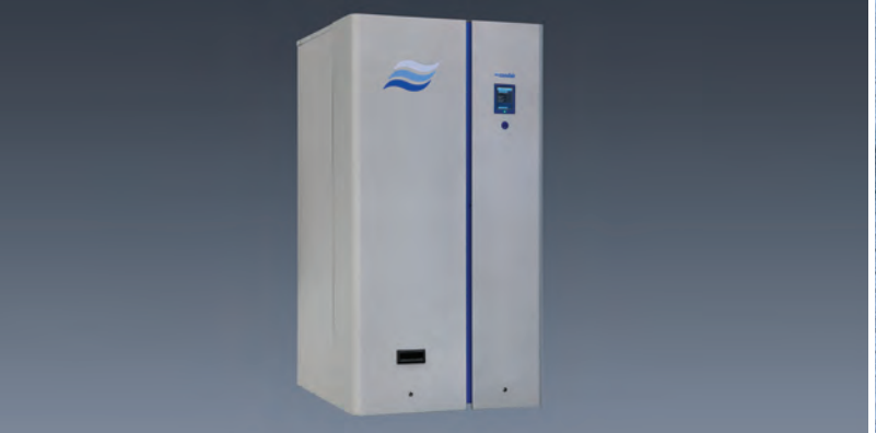
Condair GS – gas-fired steam humidifier