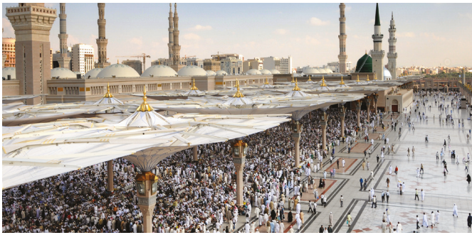
Al Masjid an Nabawi Prophet's Mosque in Medina