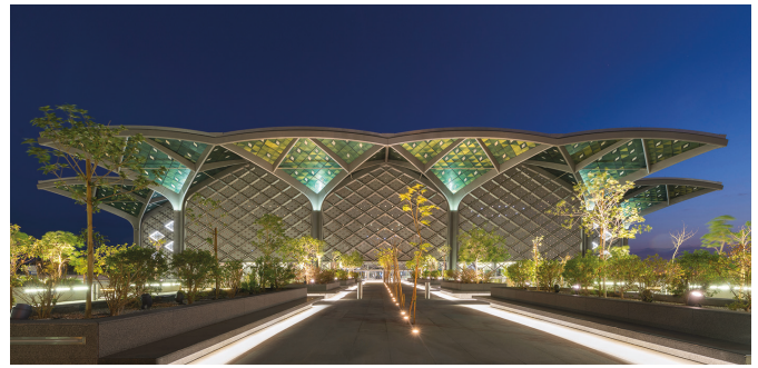
Haramain High Speed Railway Stations at Medina and Makkah